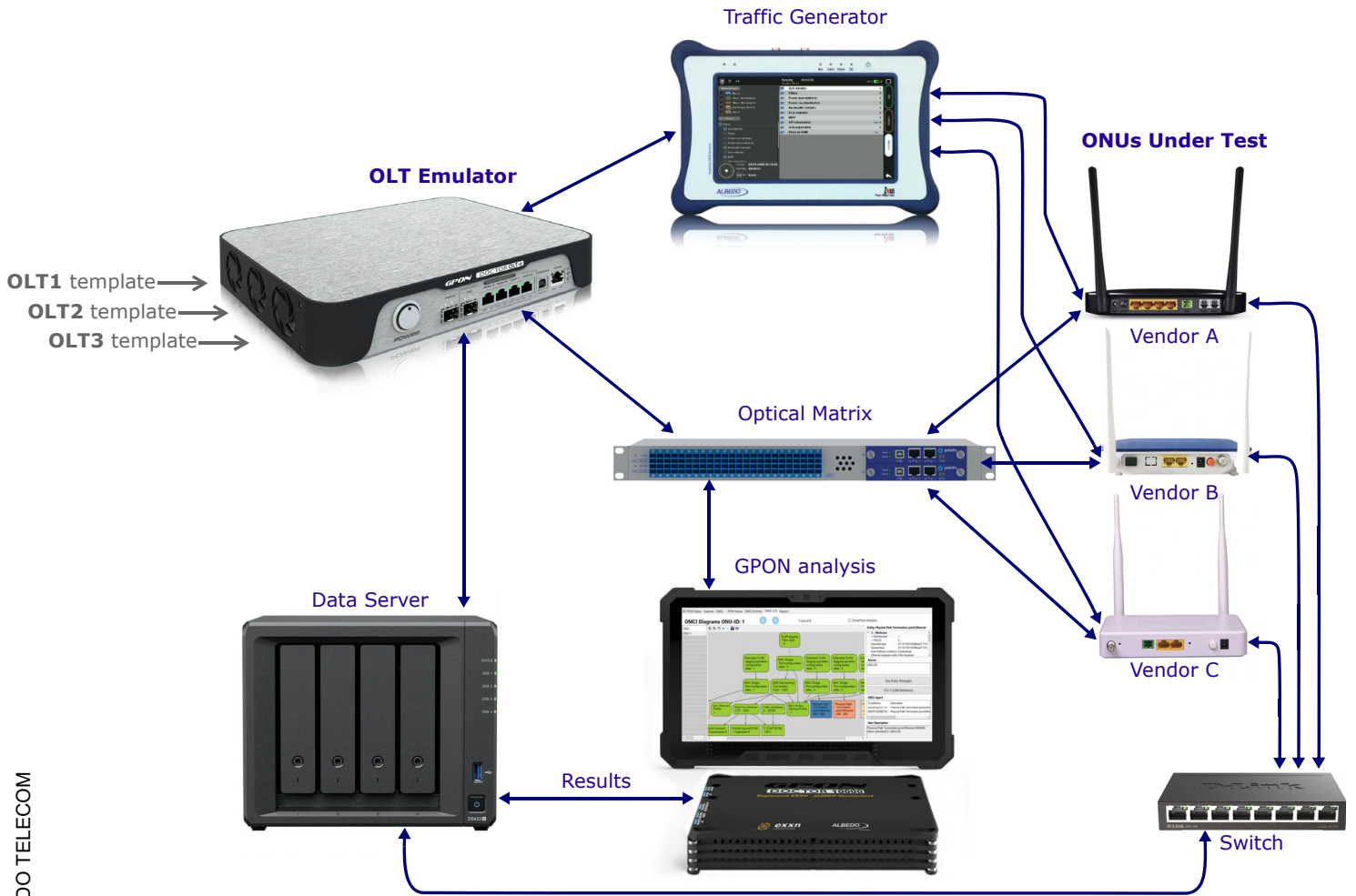
Fig 3. ONU Conformance test with GPONDoctor, xGenius and OLTe that can use templates to emulate any model of OLTs.